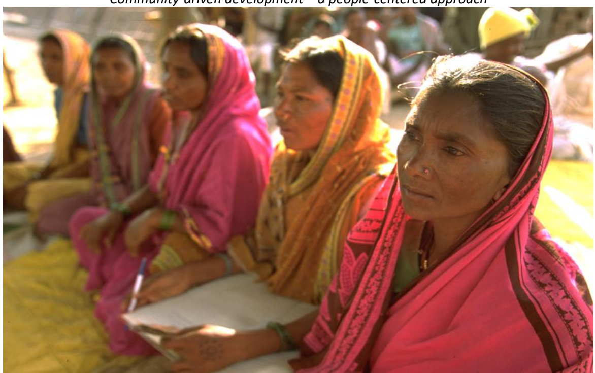
Community-driven development – a people-centered approach