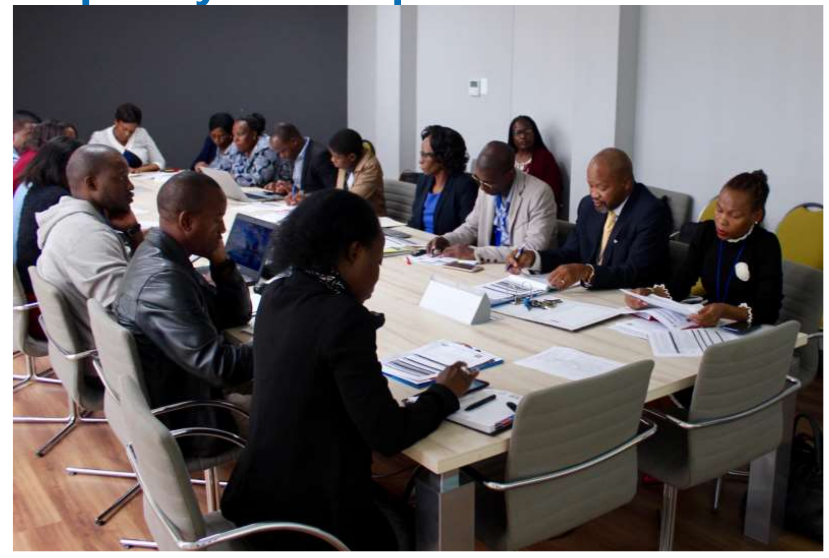
Evaluation Reference Group Meeting the independent evaluators in Mbabane, Eswatini

If Joint Evaluations are to contribute to Capacity development there has to be ->