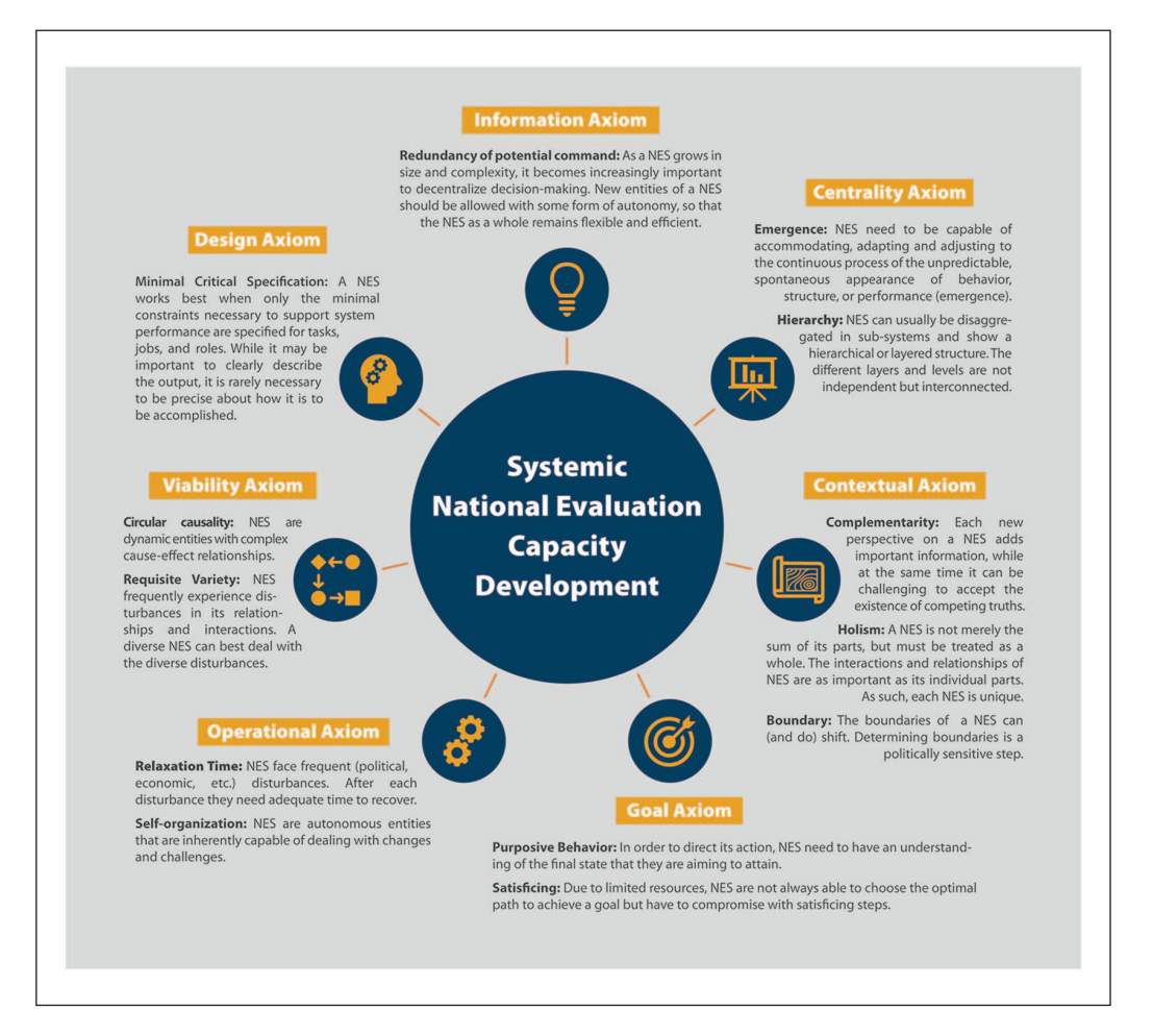
Figure 2. Depiction of the systems construct applied to national evaluation systems.