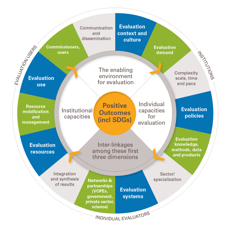
Figure 2: Dimensions of EvalAgenda 2020